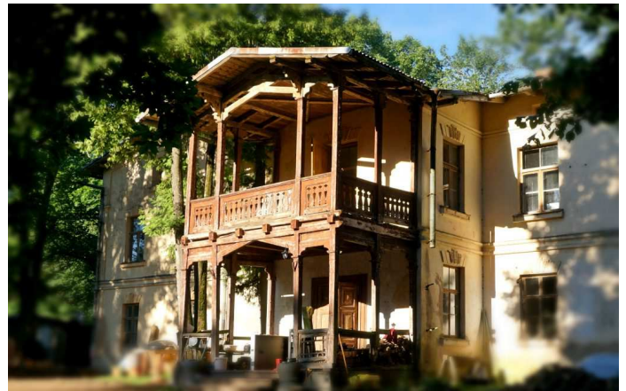
Romantic facade of Lielborne Manor

Saturday: Good morning! Take your time and enjoy delicious breakfast with a cup of flavored coffee before a half-day trip to Kraslava. You will have an excursion to the historical and romantic Kraslava castle complex followed by a spectacular boat trip down the river Daugava. The boat trip takes you through the famous nature park from Kraslava to Lielborne manor. You will have a wonderful opportunity to enjoy 50 shades of Latvian green nature from the boat. Picnic lunch at the manor after the trip will be extra tasty for sure! The afternoon is your free time to relax and admire manor's surrounding nature or enjoy other free time options available (see tips below). Dinner will be followed by a common activity with your teacher.