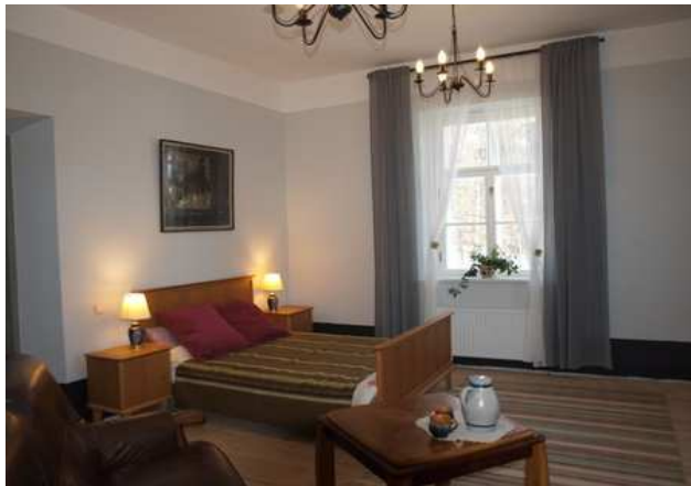
A cosy room for your weekend

Friday: You will start your amazing weekend on Friday afternoon with travel by train to Daugavpils. Daugavpils is the second largest city in Latvia with the biggest Russian speaking population. Transfer to Lielborne manor where our brand new Executive Russian language center shortly will be opened. Spend your first evening at the manor at the leisurely dinner, followed by a common activity with your teacher for about an hour.