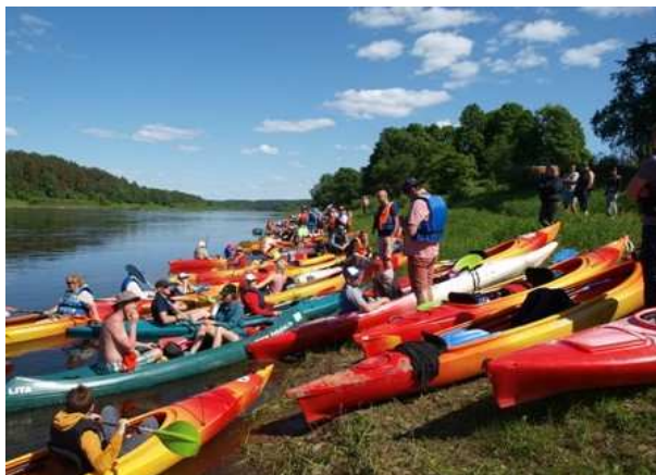
Challenging boat trip guarantees a lot of fun

Saturday: Good morning! Take your time and enjoy delicious breakfast with a cup of flavored coffee before a half-day trip to Kraslava. You will have an excursion to the historical and romantic Kraslava castle complex followed by a spectacular boat trip down the river Daugava. The boat trip takes you through the famous nature park from Kraslava to Lielborne manor. You will have a wonderful opportunity to enjoy 50 shades of Latvian green nature from the boat. Picnic lunch at the manor after the trip will be extra tasty for sure! The afternoon is your free time to relax and admire manor's surrounding nature or enjoy other free time options available (see tips below). Dinner will be followed by a common activity with your teacher.