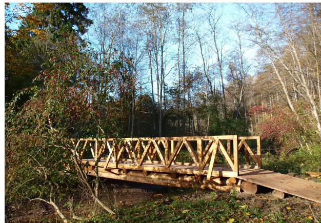
Peaceful walking paths around Lielborne Manor

Your outcome: relaxed rest in the style of eco-tourism, practice of Russian language in an informal and friendly atmosphere, new impressions about Latvia and a lot of photos ☺.