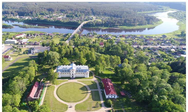
Historical Kraslava castle complex