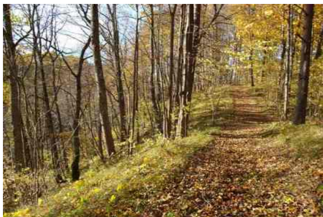
Beautiful nature in any season of the year

Free time options: individual Russian lessons according to school price list, fishing, horse riding (slow for beginner, medical ride-therapy and relaxing on horseback) cycling, walking, swimming, reading, sunbathing, playing ball or badminton, obstacle park, butterfly watching, extra boating, visit to Church or even planting a bush or tree in the park for next generations. Prices differ, starting from free of charge. We advise you to book them well in advance, please, ask for details!